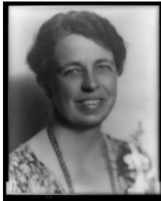
Eleanor Roosevelt in 1933